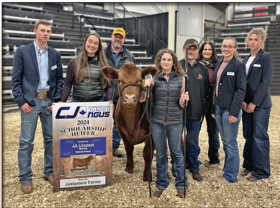
Red JJL Miss Deal 417M

We truly appreciate everyone's support of this annual initiative!