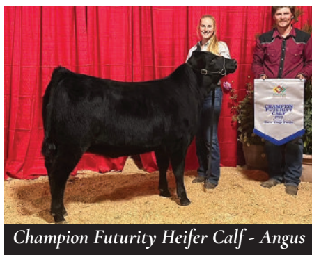
Champion Futurity Heifer Calf - Angus