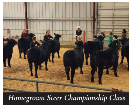
Homegrown Steer Championship Class