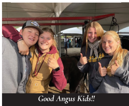
Good Angus Kids!!