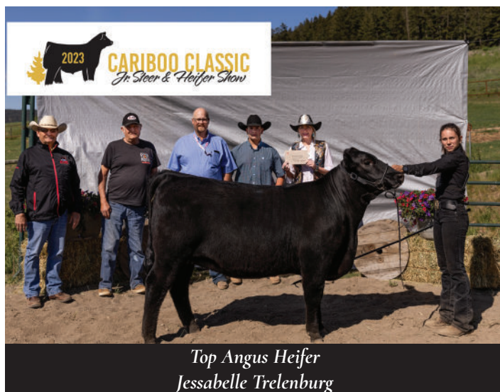
Top Angus Heifer Jessabelle Trelenburg