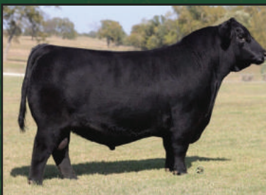
Conley South Point 8362