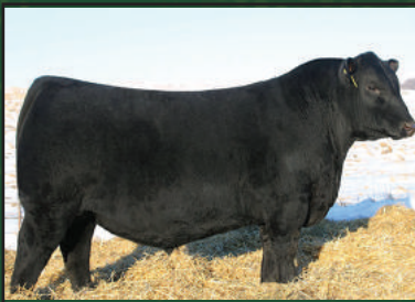
SAV Bloodline 9578