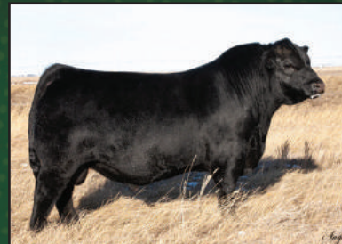
PM Executive Decision 5'17