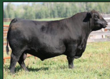
Brooking Endeavour 0101