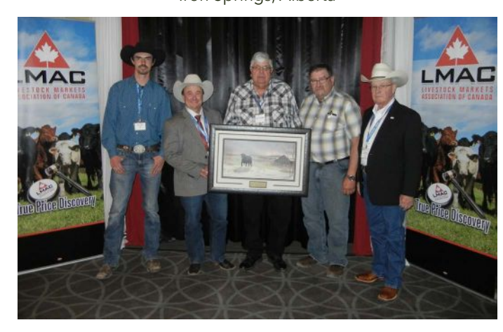
2016 Auction Market of the Year Heartland Livestock Services Swift Current Swift Current, Saskatchewan